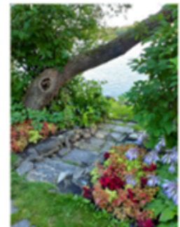
The Grounds of Kennedy House