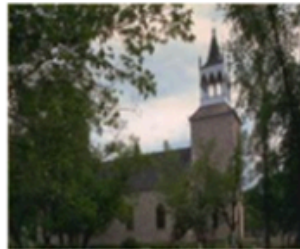
The oldest standing stone church in Western Canada