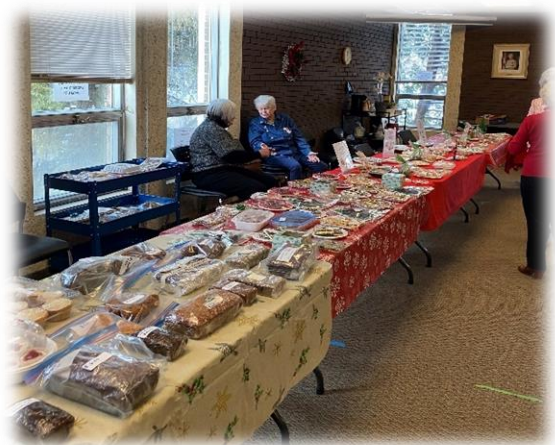
The calm before the storm!