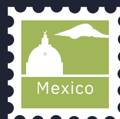
Brightwater of Tuxedo